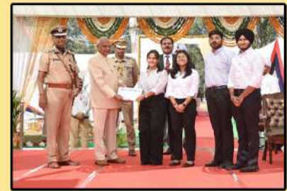
JMIT team won 1 st prize in Chandigarh Police Hackathon 2022 & awarded with Rs. 1 Lakh