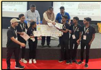
JMietI team won 1 st prize in Smart India Hackathon 2022 & awarded with Rs. 1 Lakh