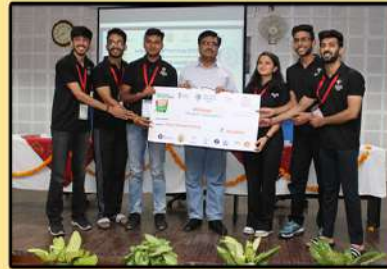
JMIT team won 1 st prize in Smart India Hackathon 2022 & awarded with Rs. 50,000